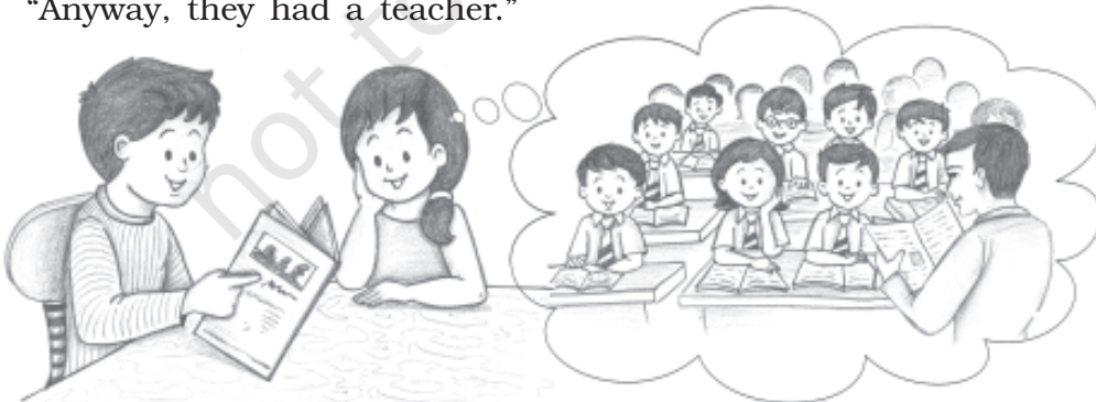
They had a teacher... It was a man.

Margie was hurt. "Well, I don't know what kind of school they had all that time ago." She read the book over his shoulder for a while, then said, "Anyway, they had a teacher."