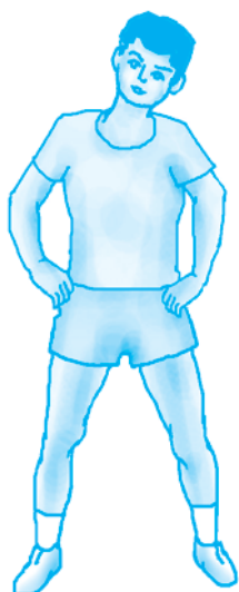
1. Head tilt (side to side)

Warming Up: Muscle stiffness is thought to be directly related to muscle injury and therefore, the warming up should be aimed at reducing muscle stiffness.