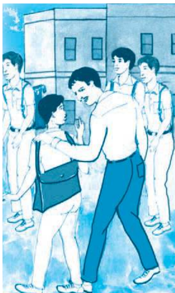
Fig. 2.2 : Parent-child Communication