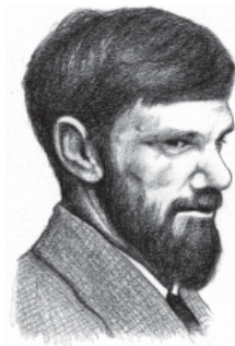
D.H. Lawrence 1885-1930

D.H. Lawrence was born in a coal-mining town. He was the son of an uneducated miner and an ambitious mother who was a teacher. His wife was German, and the couple lived, at various times, in Italy, Germany, Australia, Tahiti and Mexico.