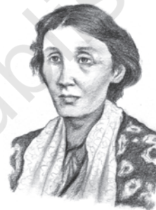
Virginia Woolf 1882-1941

This essay records fleeting impressions and delicate shades of mental experience.