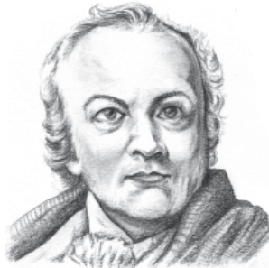
William Blake 1757-1827

William Blake was a poet, painter and engraver. He abhorred the rationalism and materialism of his times. What he saw and painted were human beings beset with evil, yet striving for the divine within them.