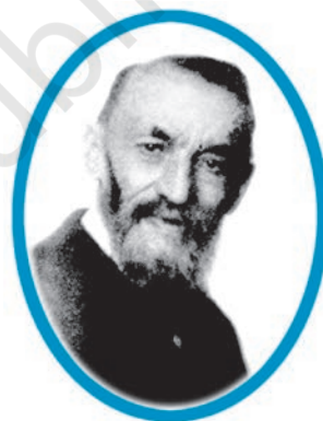
G. Peano (1858-1932)

In contrast to deduction, inductive reasoning depends on working with each case, and developing a conjecture by observing incidences till we have observed each and every case. It is frequently used in mathematics and is a key aspect of scientific reasoning, where collecting and analysing data is the norm. Thus, in simple language, we can say the word induction means the generalisation from particular cases or facts.