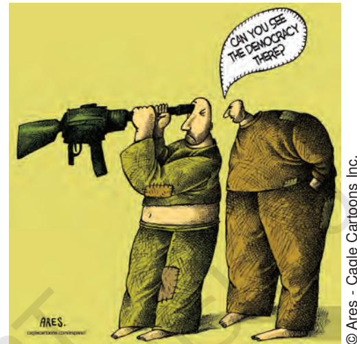
Seeing the democracy