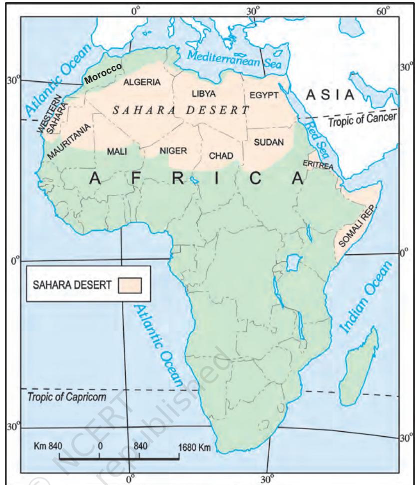
Fig. 9.2: Sahara in Africa

You will be surprised to know that present day Sahara once used to be a lush green plain. Cave paintings in Sahara desert show that there used to be rivers with crocodiles. Elephants, lions, giraffes, ostriches, sheep, cattle and goats were common animals. But the change in climate has changed it to a very hot and dry region.