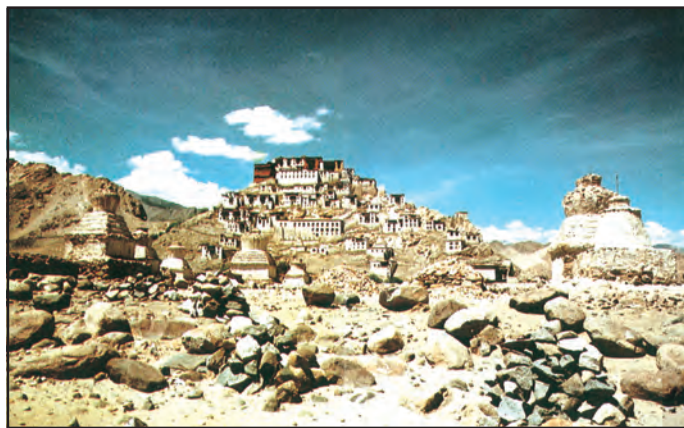
Fig. 9.5: Thiksey Monastery

In the summer season the people are busy cultivating barley, potatoes, peas, beans and turnip. The climate in winter months is so harsh that people keep themselves engaged in festivities and ceremonies. The women are very hard working. They work not only in the house and fields, but also manage small business and shops. Leh, the capital of Ladakh is well connected both by road and air. The National Highway 1A connects Leh to Kashmir Valley through the Zoji la Pass. Can you name some more passes in the Himalayas?