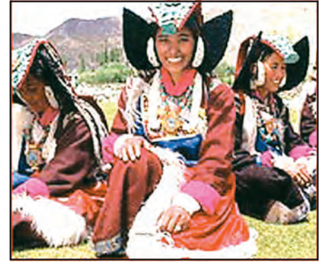
Fig. 9.6: Ladakhi Women in Traditional Dress

Life of people is undergoing change due to modernisation. But the people of Ladakh have over the centuries learned to live in balance and harmony with nature. Due to scarcity of resources like water and fuel, they are used with reverence and care. Nothing is discarded or wasted.