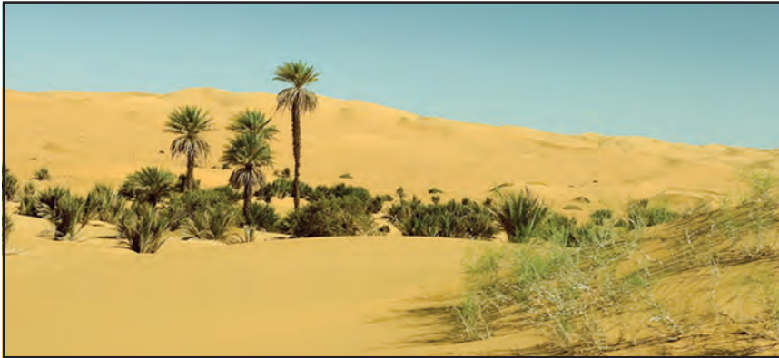
Fig. 9.3: Oasis in the Sahara Desert

snakes and lizards are the prominent animal species living there.