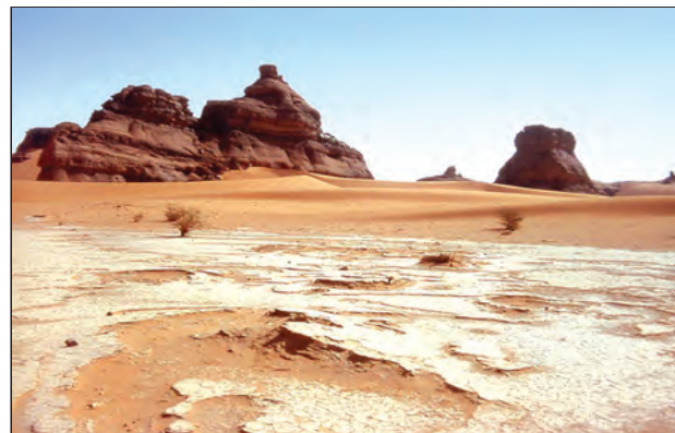
Fig. 9.1: The Sahara Desert

Look at the map of the world and the continent of Africa. Locate the Sahara desert covering a large part of North Africa. It is the world's largest desert. It has an area of around 8.54 million sq. km. Do you recall that India has an area of 3.2 million sq. km? The Sahara desert touches eleven countries. These are Algeria, Chad, Egypt, Libya, Mali, Mauritania, Morocco, Niger, Sudan, Tunisia and Western Sahara.