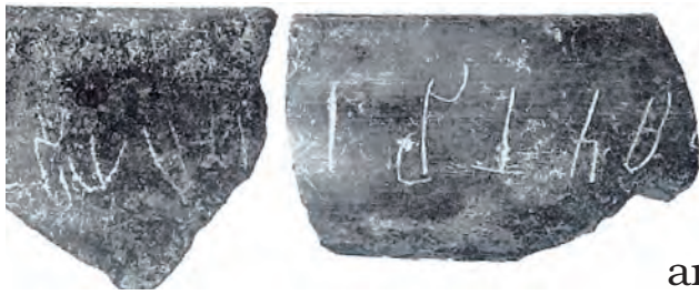
Tamil-Brahmi inscriptions. Several pieces of pottery have inscriptions in Brahmi, which was used to write Tamil.

Small tanks have been found that were probably dyeing vats, used to dye cloth. There is plenty of evidence for the making of beads from semi-precious stones and glass.